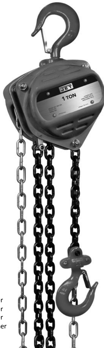
1-Ton model shown

For S90-100 serial no. 15070361H and higher For S90-150 serial no. 15070389H and higher For S90-300 serial no. 15070605H and higher For S90-1000 serial no. 15070767H and higher