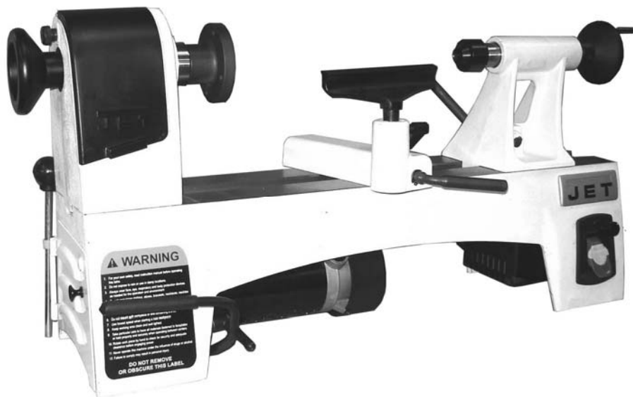
model JWL-1015VS shown