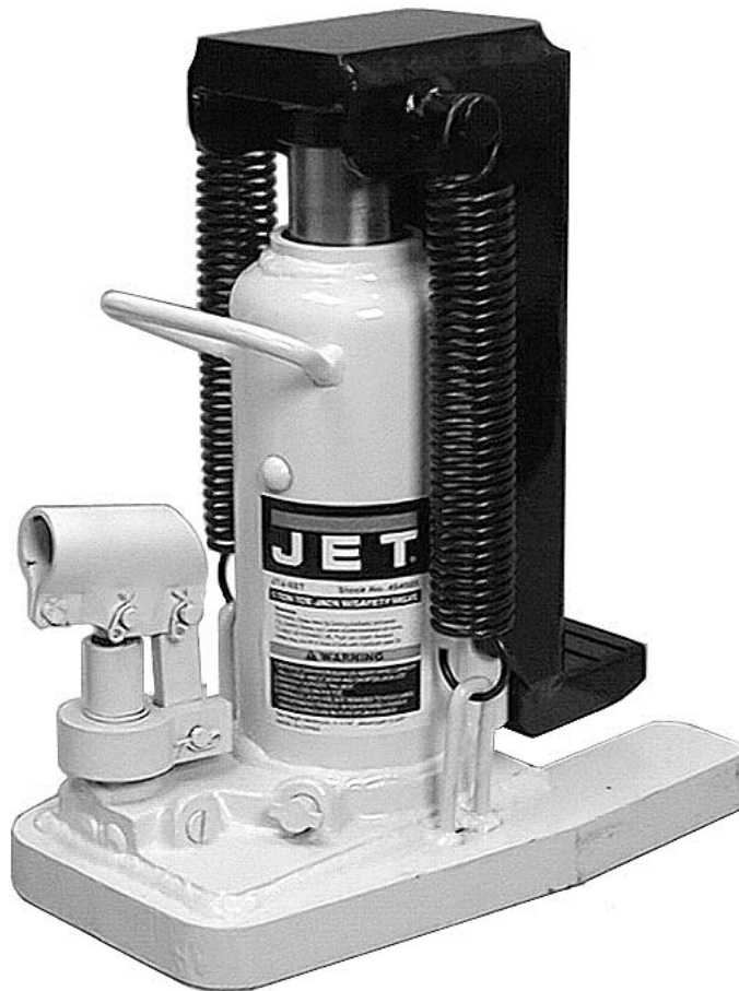
(5-Ton model shown)

JET 427 New Sanford Road LaVergne, Tennessee 37086 Ph.: 800-274-6848 www.jettools.com