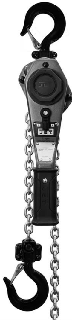
1 Ton model shown

JET 427 New Sanford Road LaVergne, Tennessee 37086 Ph.: 800-274-6848 www.jettools.com